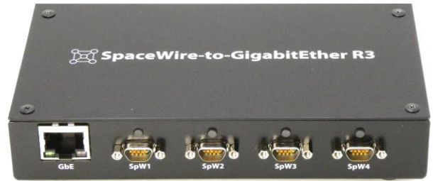
Model No.: GPWGB0300